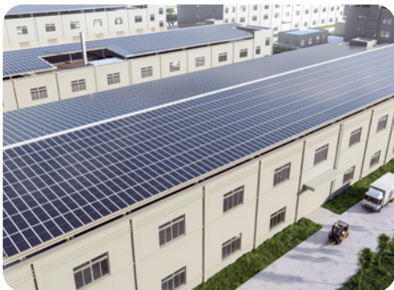
Flat-to-pitched Roof Conversion