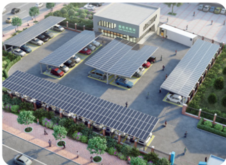
PV Charging Carport With Storage